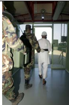
A detainee is escorted to a medium security facility at Guantanamo Bay, Cuba.