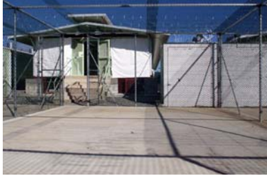
A Camp Delta recreation and exercise area at Guantanamo Bay, Cuba.

These photos from inside Camp Delta have been approved for Public Release. They can be found online at http://www.dod.mil/photos/Operations/OperatiEndurinFreedo .