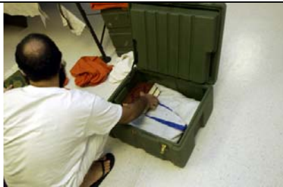
A detainee packs his personal belongings prior to being relocated to a medium security facility at Guantanamo Bay.