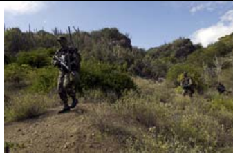
Army soldiers conduct a dismounted patrol in Guantanamo Bay.