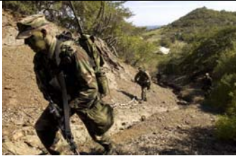
U.S. Army soldiers conduct a dismounted patrol in Guantanamo Bay, Cuba.