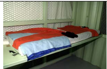
Comfort items issued to detainees at Camp Delta, Guantanamo Bay, Cuba.