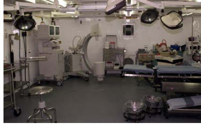
The operating room at the detainee hospital at Camp Delta.