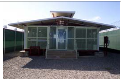
A forty-eight-person detention block at Camp Delta, Guantanamo Bay.