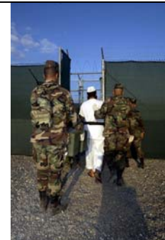
A detainee is escorted to a medium security facility at Guantanamo Bay.