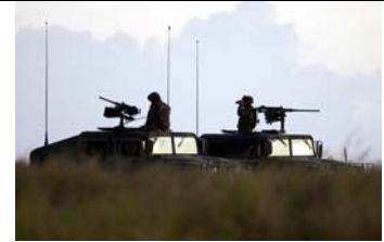
A U.S. Army soldier uses binoculars to scan the perimeter of the Leeward Airfield at Guantanamo Bay, Cuba.